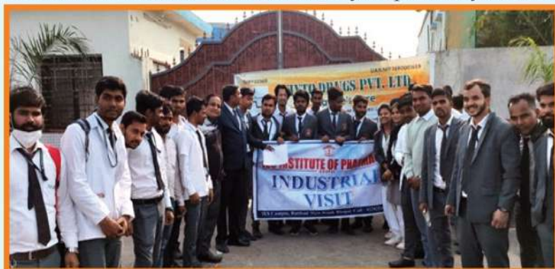
Students at Phyto Drugs Pvt. Ltd.