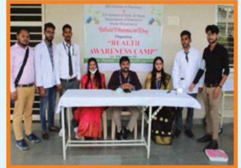
Students and Faculties participated in Health Awareness Camp