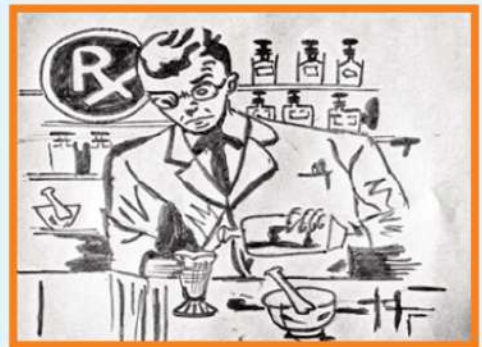
Students of Pharmacy participated in Intra Poster Competition