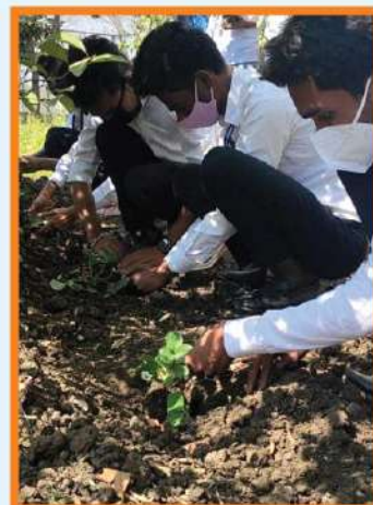
Pharmacy Students plant saplings to spread awareness on environment conservation.