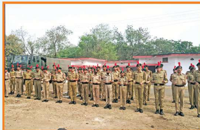
Pharmacy Students Attending NCC Camp