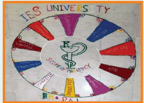
Students of Pharmacy participated in Intra Rangoli Competition