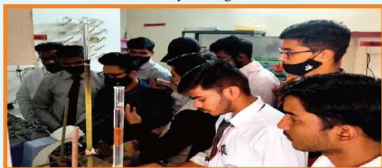
3rd Sem Students at Scan laboratory, Bhopal